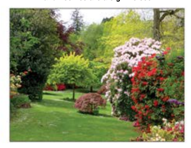
Both Summer and Winter bring their own very special treats for garden lovers.